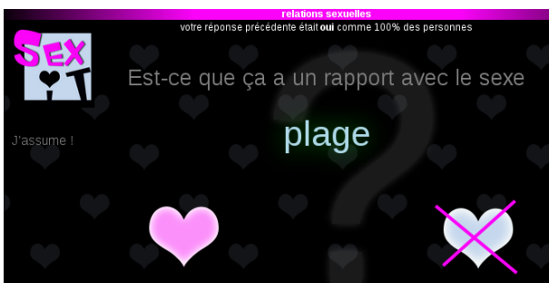
Figure 3: SexIt: is “beach” ( plage ) related to sex?

SexIt 5 allows players to identify a term as being related to sex or not (see an example in figure 3, for “beach”). It is a pseudo game : there is no score, no ranking, no gain, only a poll-like comparison with other players. It is played only because the topic is fun: we would have had more difficulties collecting data on taxation, for example. This is an important limitation for language resource building using that kind of interaction. Collecting information about vocabulary related to sex can be necessary, for example to detect pornographic contents. However, such information is insufficient for discriminating pornography from courses in biology, reproduction or anatomy which, while not being pornographic, contain their share of sex-related terms.