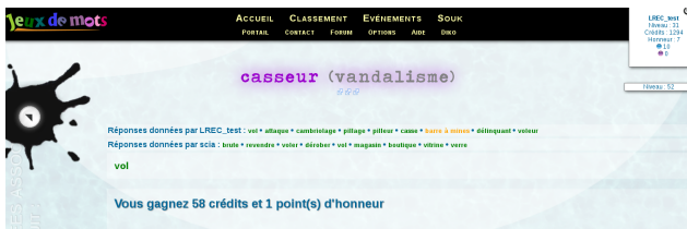
Figure 2: JeuxDeMots: recap of a game involving “casseur” (hooligan).

A galaxy of pseudo games (the definition is given in section 2.2.) were created around JeuxDeMots, including mainly LikeIt 1 , AskIt 2 or ColorIt 3 , that add information to the network. SexIt is one of them.