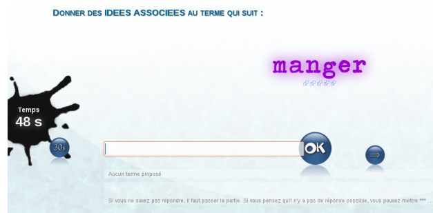
Figure 1: JeuxDeMots: give ideas associated with “manger” (to eat).

The principle behind JeuxDeMots is quite straightforward: players are asked to enter ideas associated with a term chosen by the system (see figure 1). Players get points if they have answers in common with other players. The more original the answer, the more points are rewarded, but the higher the risk of having no intersection at all with others.