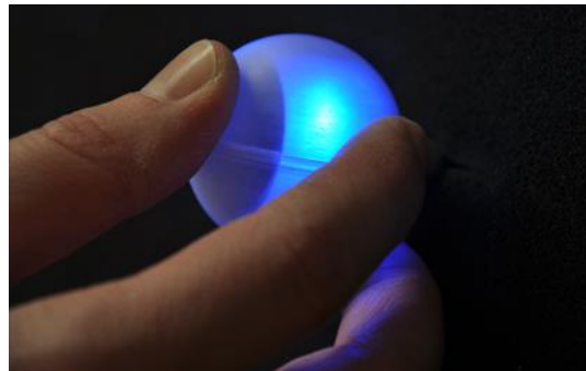
Figure 1. The Energy Flow Prototype.

Institute of Ergonomics Technische Universität München koerber@lfe.mw.tum.de