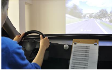
Figure 2. Setup of the simulator study.

To provide multimodal feedback in terms of sound, vibrations and light, we integrated three different actuators into the prototype. The ambient light (see Figure 1) is emitted by a blue LED. Audio feedback is created by a small speaker. Haptic feedback is produced by a small vibration motor. The vibrations are transmitted to the acrylic glass and are thus perceivable when the prototype is touched.