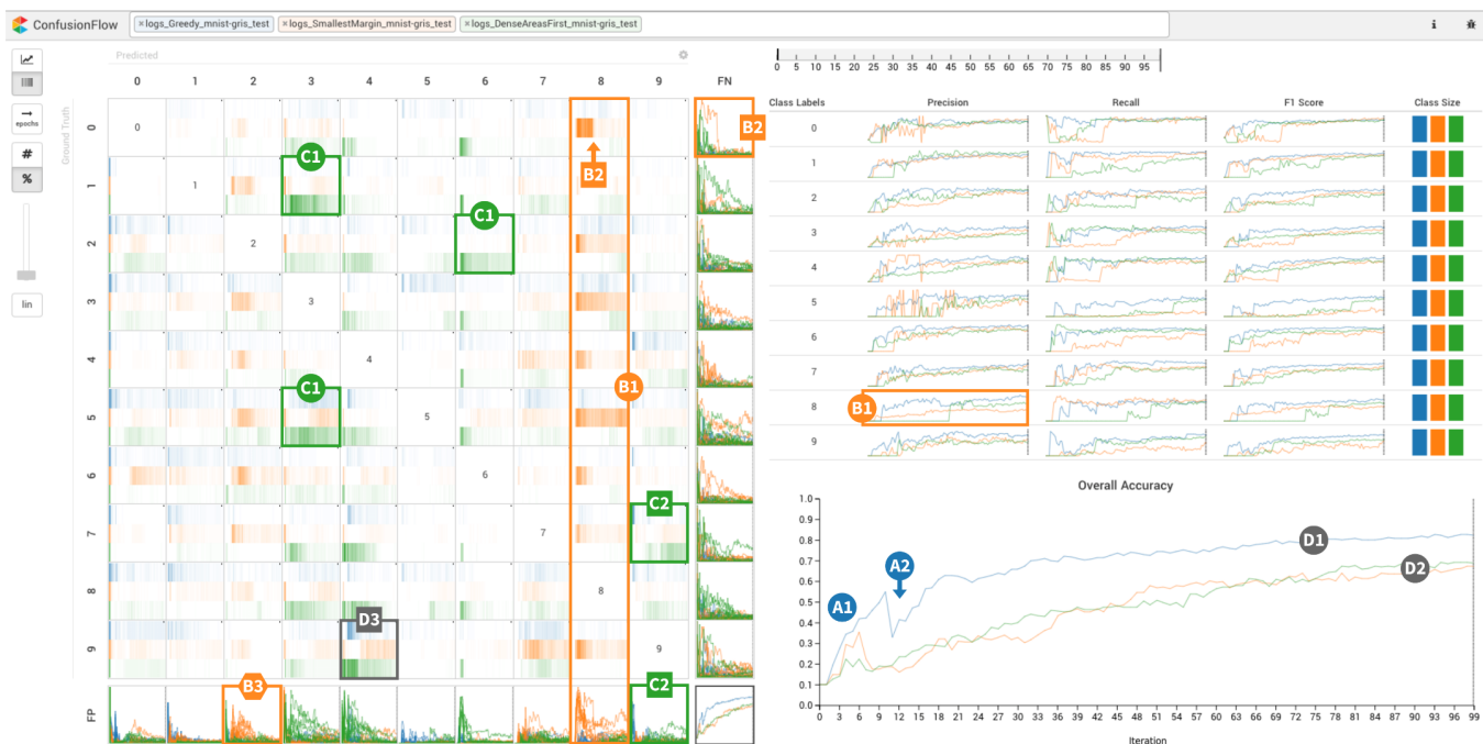
(b) ConfusionFlow supports developers with visualizations during performance analysis of classifiers