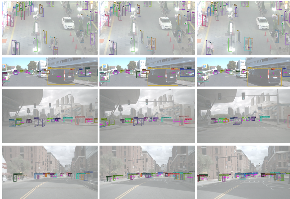
Fig. 3: Qualitative results on MOT (1st row), KITTI (2nd row), and nuScenes (3rd and 4th rows). Each row shows three consecutive frames. We show the predicted tracking offset in arrow. Tracks are coded by color. Best viewed on the screen.

The results are shown in Table 6. All models use the exact same detector. On the high-framerate MOT17 dataset, any motion model suffices, and even no motion model at all performs competitively. On KITTI and nuScenes, where the intra-frame motions are non-trivial, the hand-crafted motion rule of the Kalman filter performs significantly worse, and even the performance of optical flow degrades. This emphasizes that our offset model does more than just motion estimation. CenterTrack is conditioned on prior detections and can learn to snap offset predictions to exactly those prior detections. Our training procedure strongly encourages this through heavy data augmentation.