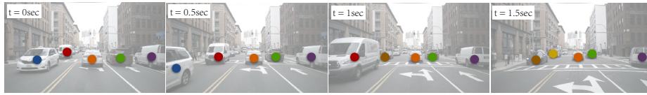
Fig. 1: We track objects by tracking their centers. We learn a 2D offset between two adjacent frames and associate them based on center distance.

recent CenterNet detector to localize object centers [55]. We condition the detector on two consecutive frames, as well as a heatmap of prior tracklets, represented as points. We train the detector to also output an offset vector from the current object center to its center in the previous frame. We learn this offset as an attribute of the center point at little additional computational cost. A greedy matching, based solely on the distance between this predicted offset and the detected center point in the previous frame, suffices for object association. The tracker is end-to-end trainable and differentiable.