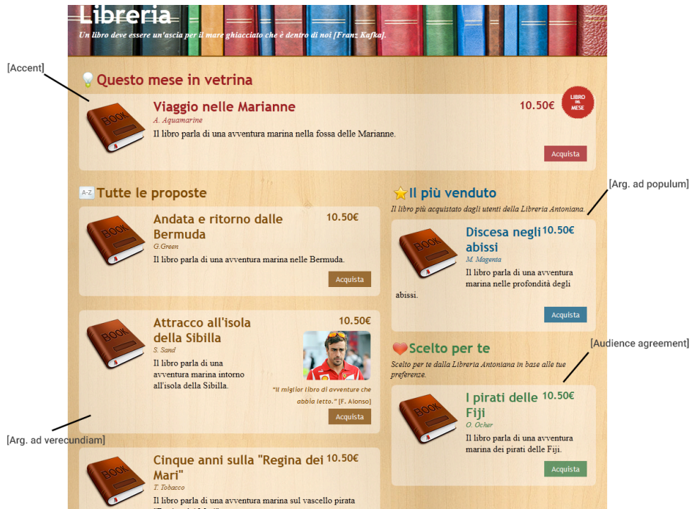
Figure 4. A screenshot of the persuasive version of the online bookshop website (fallacious persuasion strategies are highlighted).

The book to present as a personalized suggestion ( audience agreement ) was selected according to the similarity of its title to that of the classic chosen by a certain participant in the intro page, while the books connected to the other three fallacies were chosen at random for each participant. The remaining six books were simply presented in alphabetical order, in the left-side column.