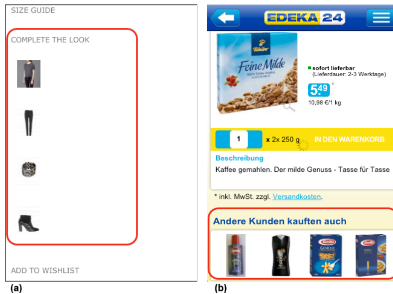
Figure 2. An example of the audience agreement fallacy in AllSaints (a, content-based suggestion) and Edeka 24 (b, collaborative-filtering-based suggestions).

the use of recommendation techniques (see Figure 2). Finally, the argumentum ad consequentiam has been associated to the presence of software environments which are able to simulate the consequences of certain user choices, and the accent fallacy to the case when part of the purchasing-related information is emphasized and part is hidden (e.g. when shipping or tax costs are presented only at the end of the purchasing process, or when certain products are given more visual prominence than others).