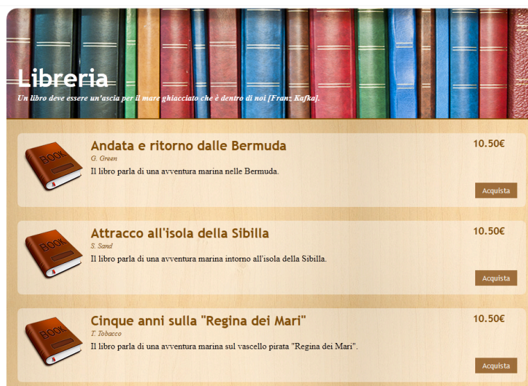
Figure 3. A screenshot of the non-persuasive version of the online bookshop website.

Having decided to carry out our experiment in the context of an online bookshop, we prepared some basic information to present ten imaginary books belonging to the same genre, seafaring adventures: the title, the name of the author and a short description. All information was made up and we paid attention that it followed a similar format for all the books, in order to limit the number of factors which might influence participants' choices. For example, we had a book entitled "Docking at Sibyl Island (Attracco all'Isola della Sibilla)", written by the imaginary author "S. Sand", with the following short description: "This book deals with a seafaring adventure on Sibyl Island". Moreover, all books had the same price (10.50 €).