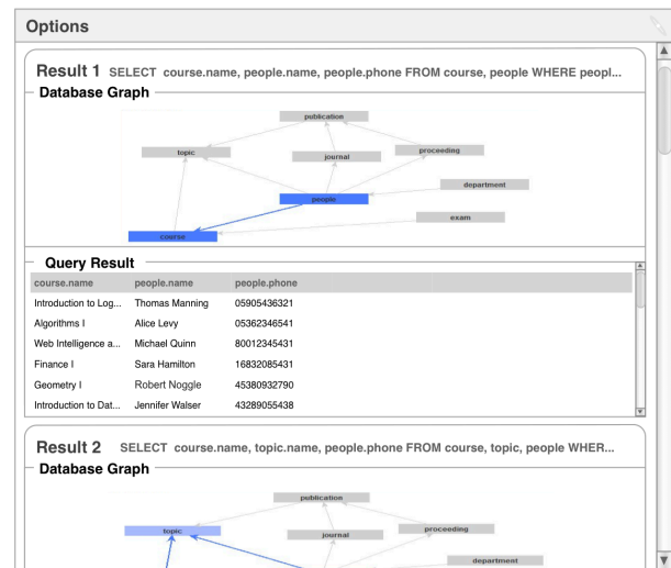
Figure 2: The QUEST user interface.

There are five main messages we intend to communicate to the audience through this presentation. First, we will demonstrate that