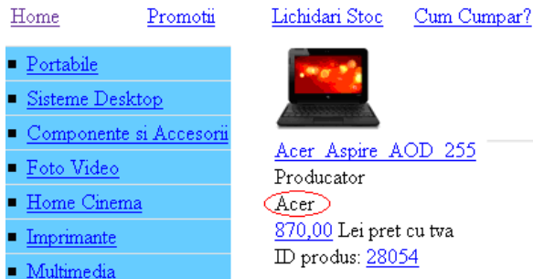
Fig.2: Displayed results