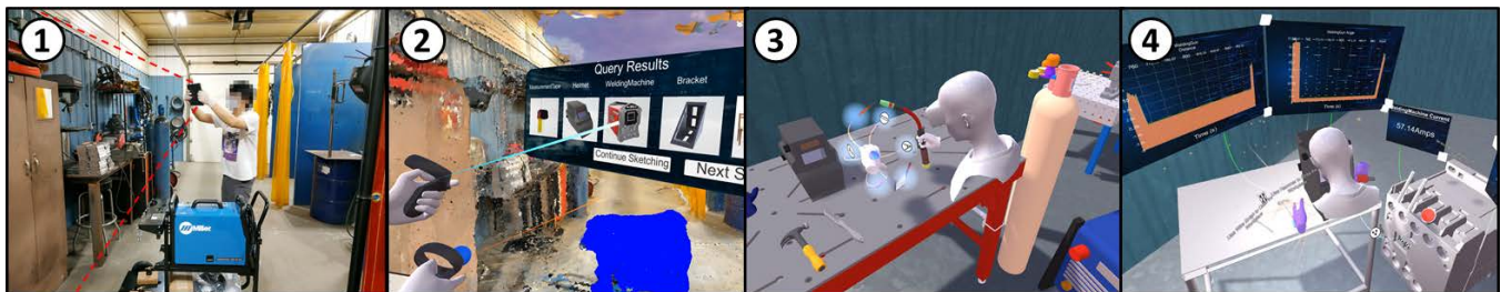
Figure 1: Workflow of VRFromX. User (1) scans a real environment to get raw point cloud using an iPad Pro, (2) creates virtual content by interacting with the point cloud using a Brush Tool and searching in repository through AI assistance, (3) attaches functions to the virtual objects using an Affordance Recommender and, (4) finally interacts with the reconstructed scene in a virtual environment.

Karthik Ramani ramani@purdue.edu C Design Lab, Purdue University West Lafayette, IN, USA