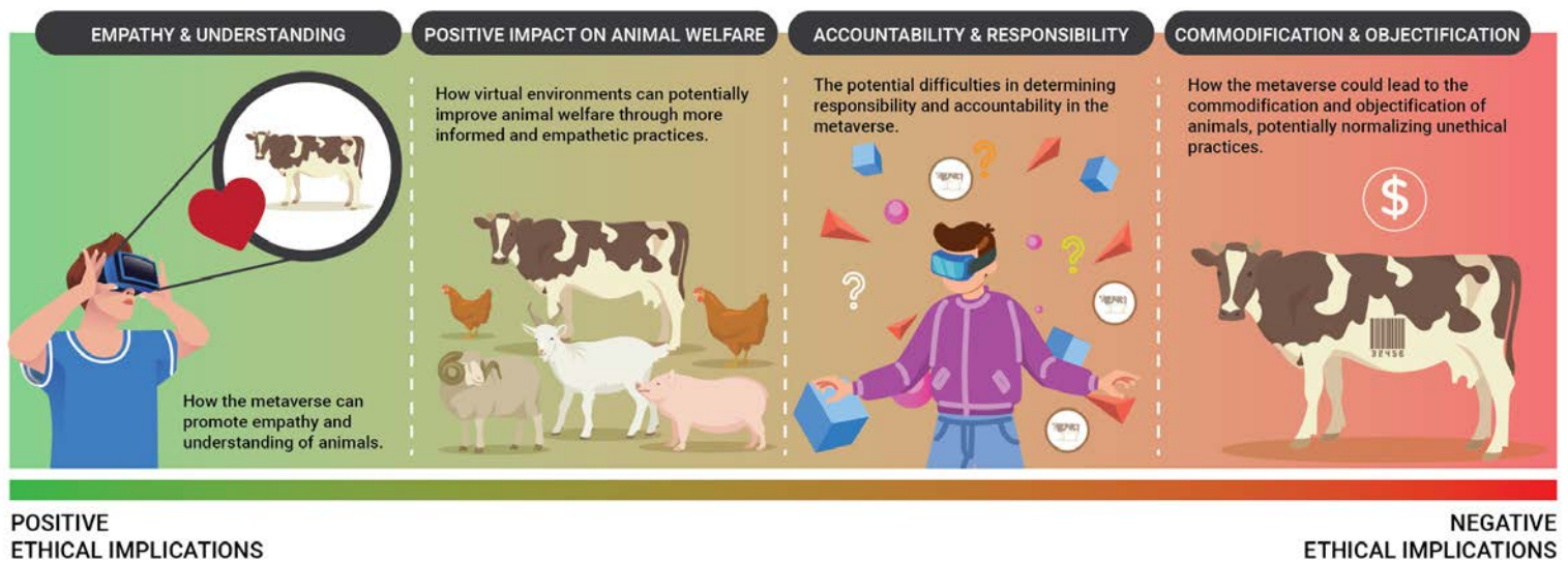
Figure 2. The ethical spectrum of metaverse in modern animal farming.

Navigating the ethical spectrum of metaverse implementation in animal farming requires balancing technological advancements with animal welfare, environmental sustainability, and societal values (Figure 2). As the metaverse transforms the agricultural landscape, it is crucial to prioritize ethical practices, maintain public trust, and ensure that the adoption of such technologies does not compromise the well-being of animals or the ecosystem. Engaging in open, multidisciplinary dialogue among stakeholders, from farmers to policymakers, will pave the way for responsible, conscientious integration of metaverse technologies in modern animal farming.