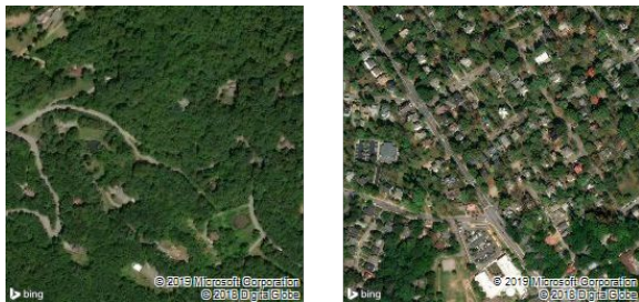
Figure 4: Examples of satellite images on zoom level 16. Images © Microsoft (2019).

of Candler and Woodfin (n=1916) in the Asheville area, not represented in the training set. For training, we randomly split the remaining dataset into 80% training set and 20% validation set. Following the approach of Law, Paige, and Russell (2019), we trained all models using the Adam optimizer for a maximum of 80 epochs. For the CNNs, we used the additive combination of RMSE and MAE as the loss function. We performed early stopping using the validation dataset to store the model with the best performance on the validation data. For better convergence of the neural network, we log-transformed the real-estate price and min-max normalized the relational and image data.