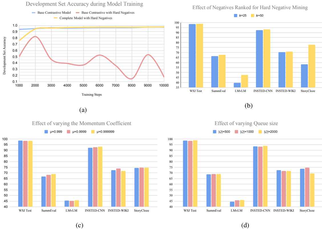
Figure 2: (a) A plot of the development accuracy during training our contrastive model with and without hard negative mining, and our complete model with hard negative mining. The accuracies are evaluated after every 1000 gradient steps. (b) Results on the various test sets for our model trained with hard negative mining by sampling different number of negatives ( h ) for ranking. (c) Results on the various test sets for our complete model trained with different momentum \mu coefficient ( \mu ) values. (d) Results on the various test sets for our model trained with different global queue Q sizes. Please note that the agreement values for LMvLM test set have been scaled by a factor of 100 to facilitate visualization in figures (b), (c) and (d).

most prior work (Elsner and Charniak, 2011; Moon et al., 2019). We now test the effectiveness of other datasets, by varying the task itself and by using a different dataset for the permuted document task.