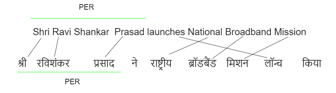
Figure 4: Correct Projection and Alignment using Awesome Align