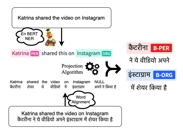
Figure 1: Illustration of Named Entity projection. We perform (i) NER with fine-tuned English BERT model, followed by (ii) word alignment between parallel sentence pair and (iii) projection of the English entities onto Indic sentence.

Named Entity Recognition (NER) is a fundamental task in natural language processing (NLP) and is an important component for many downstream tasks like information extraction, machine translation, entity linking, co-reference resolution, etc. The most common entities of interest are person, location, and, organization names, which are the focus of this work and most work in NLP. Given high-quality NER data, it is possible to train goodquality NER systems with existing technologies (Devlin et al., 2019). For many high-resource languages, publicly available annotated NER datasets (Tjong Kim Sang, 2002; Tjong Kim Sang and De Meulder, 2003a; Pradhan et al., 2013; Benikova et al., 2014) as well as high-quality taggers (Wang et al., 2021; Li et al., 2020) are available.