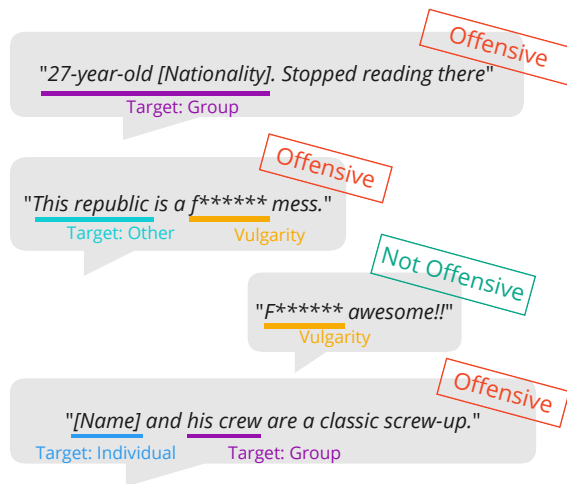
Figure 1: The posts show the importance of the target of an offensive statement in determining its severity and demonstrate how non-offensive remarks can be vulgar.

comments (e.g., offensive stereotyping), in contrast to incivil user comments (e.g., vulgarity), are perceived as more offensive and as a stronger threat to democratic values and society, as well as receiving a stronger support for deletion (Kümpel and Unkel, 2023). This highlights the importance of moderation approaches that include a more nuanced understanding of online norm violations.