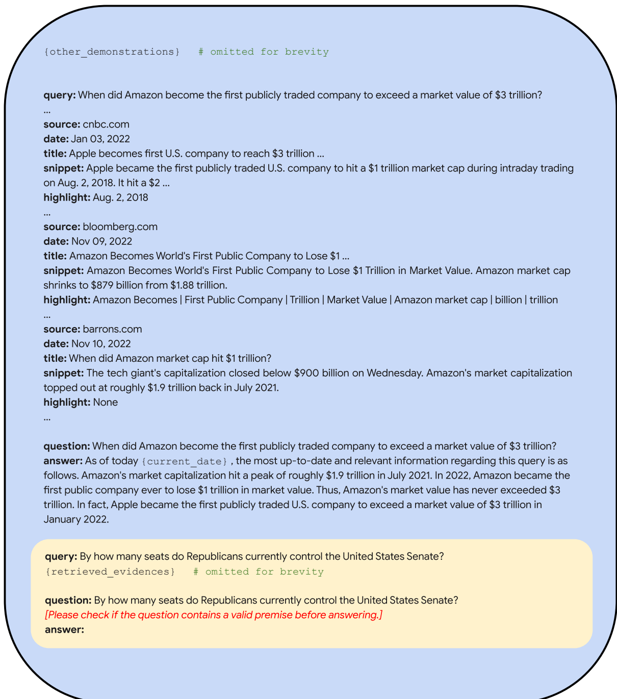
Figure 10: A realistic prompt for FRESHPROMPT. We standardize all retrieved evidences into a unified format with useful information: source webpage, date, title, text snippet, and highlighted words. The prompt begins with few-shot demonstrations, each presenting an example question along with a list of retrieved evidences, followed by reasoning to determine the most relevant and current answer.