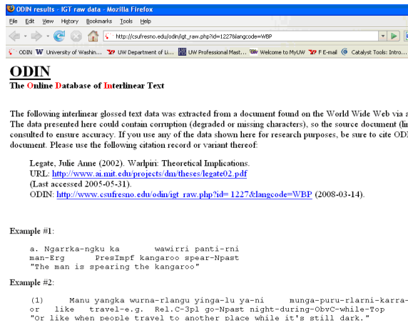
Figure 1: IGT instances in a document

target language data. Figure 2 shows the list of linguistic constructions that are currently covered.