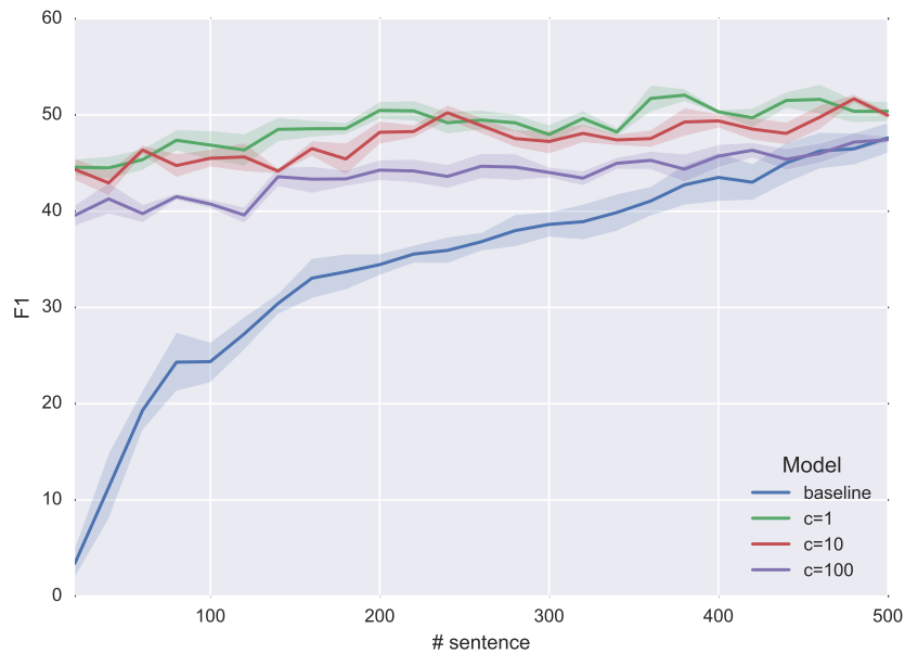
Figure 1: Absolute NER performance for Turkish ( y -axis) as a function of corpus size ( x -axis). The y -axis gives the F1 score on a held-out evaluation set (averaged over 10 bootstrap replicates, with error bars showing 95% confidence intervals). Our generative approach is compared to a baseline discriminative model with lexicon features (lowest curve). 500 held-out sentences were used to create the lexicon for both methods. Note that increasing the pseudocount c for lexicon entries (upper curves) tends to decrease performance for the generative model; we therefore take c = 1 in all other experiments. This graph shows Turkish; the corresponding Uzbek figure is available as supplementary material.