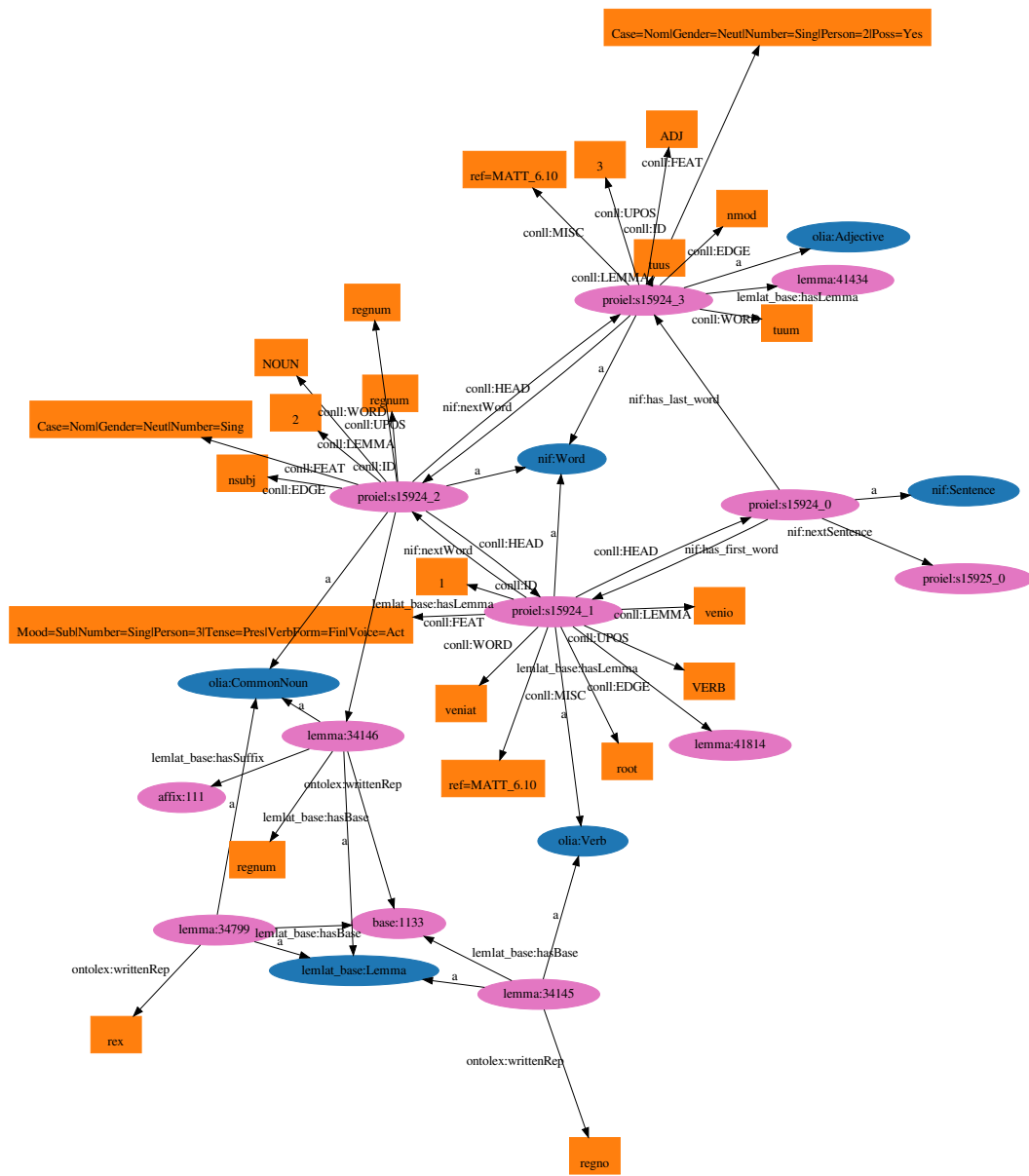
Figure 2: A sentence from PROIEL as RDF triples in the LiLa Knowledge Base.