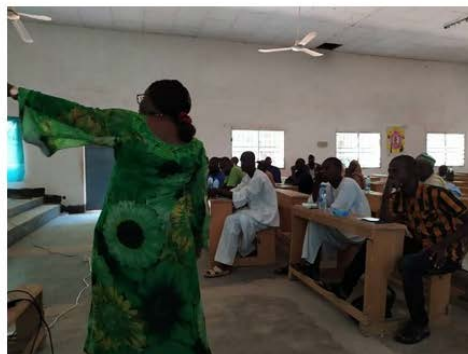
Local farmers sensitizing their peers on AMR Extreme-North, October, 2019