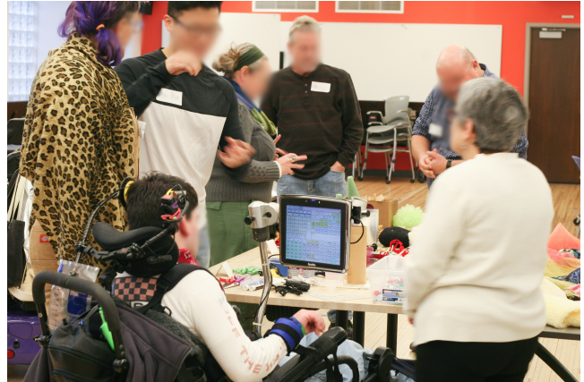
Figure 1: We explore the metaphor of an “assistive sidekick” to design robots that assist augmented communicators by playing a supporting role through nonverbal behavior.

Speech generating devices, a type of augmentative and alternative communication (AAC) system that is often used by individuals with speech and motor disabilities, produce synthetic speech from a user’s selection of letters, words, or images on a tablet or computer [7]. Speaking using an AAC device usually takes longer due to message composition delays, with rates ranging from 3-10 words per minute [23, 27]. Even though AAC systems enable communication, verbal speaking partners (non-AAC speakers) often negatively impact the interaction. For example, when they communicate with an augmented communicator (AC) who uses an AAC device they often do not allow enough time for communication, or lack familiarity with an AC’s communication style [21, 45, 46]. Partners may