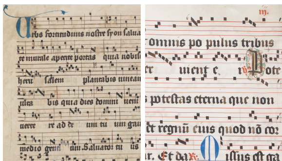
(a) EINSIEDELN (b) SALZINNES