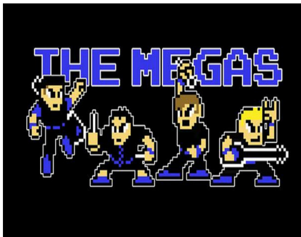
Fig 3. 8-bit color images