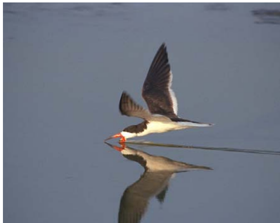
Fig 1. 24-bit images

We can take this advantage of this feature to hide data within these areas and that by replacement bit of image by bit of data which should be hidden [16].