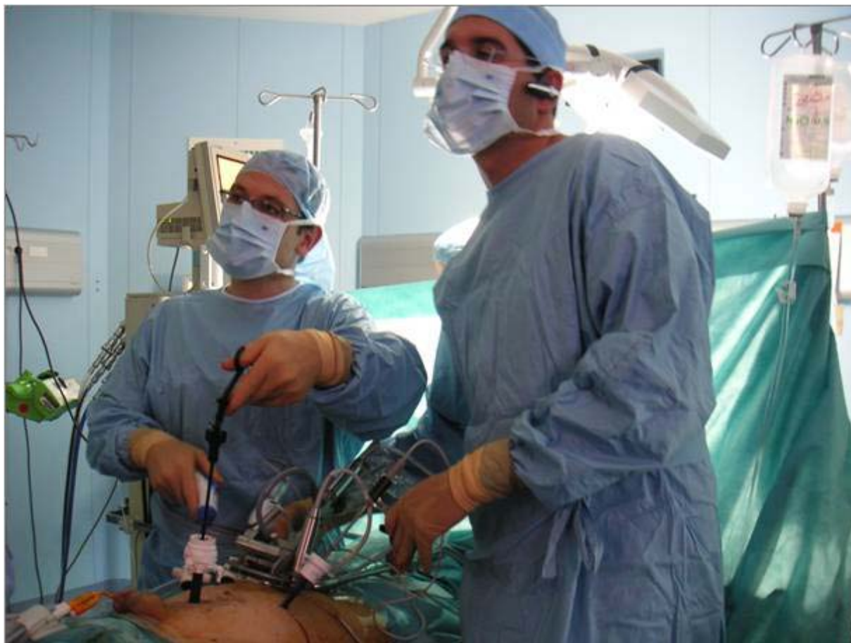
Figure 2: The robotic system in use. Pay attention to the headset device allowing voice recognition.