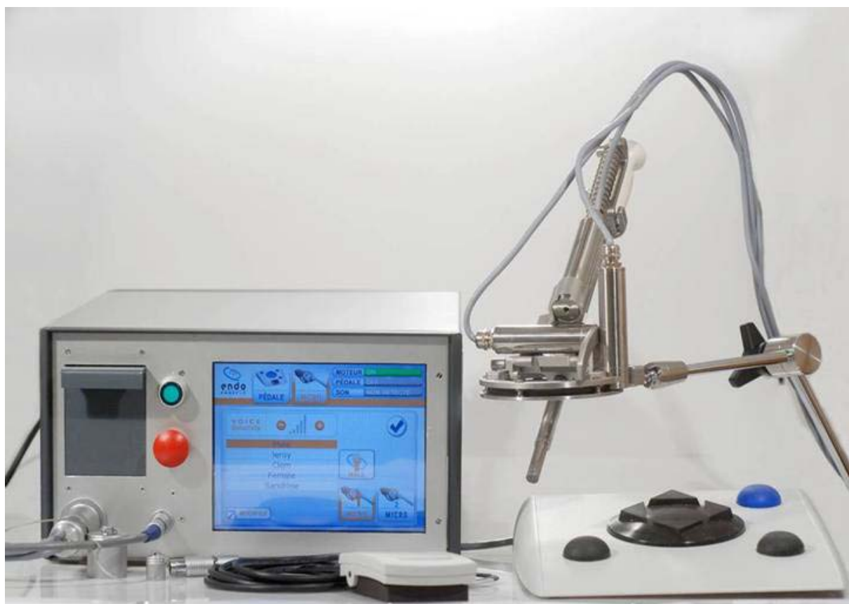
Figure 1: The robotic system including the console, the robot and the pedal.