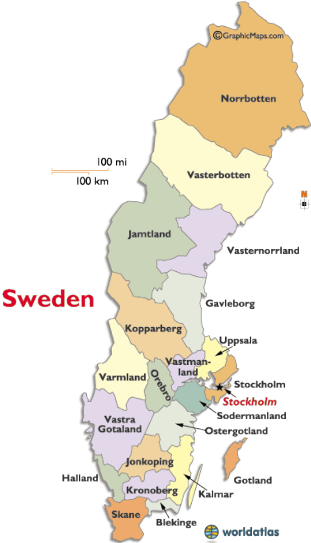
Figure 2: Location of the 21 Swedish counties at the NUTS 3 level. 2

Sweden spends 3.42% of its GDP on R&D (2010 data; Eurostat, 2010) and ranks in this respect number two—after Finland with 3.87%—among the European nations. The knowledge infrastructure of Sweden is centralized in three metropolitan areas: Stockholm, Gothenburg, and Malmö. The capital region of Stockholm hosts Karolinska Institute—one of Europe’s largest medical universities—Stockholm University, the Royal Institute of Technology, and the Stockholm School of Economics. Uppsala University (founded in 1477) is located in the neighboring county of Stockholm. Gothenburg, located in Västre Götaland, hosts the University of Gothenburg and Chalmers University of Technology. The largest university, Lund University, is located in Skåne (that is, the region surrounding Malmö).