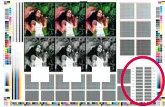
Figure3: The new test form for Printing 5, the red circle shows the hidden words inside the patches.

images is more similar to image that was separated using ISOcoated_v2_300_eci.icc.