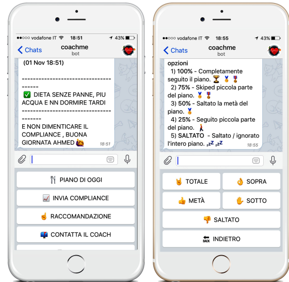
Figure 2. A Dietary Plan Provided by CoachMe Bot.

for simplicity in user-caregiver interaction instead of auto generated recommendations will create a difference in adhering users to follow a healthy and sustainable lifestyle. In addition, by understanding participant's engagement with the bot, we could decide the targeted user group as potential candidates for evangelising the human-bot interaction. An example of typical daily plan on the bot UI can be seen in Figure-2.