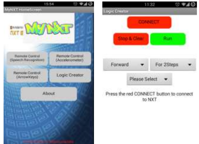
(a) The home screen of MyNXT (b) The Logic Creator of MyNXT Fig. 1. MyNXT’s home screen (a) and the Logic Creator function (b)

corresponding screens, which offer the user three types of direct control over Bluetooth to the NXT. The first type, speech recognition, recognizes specified voice commands on the touch of the microphone icon. Those commands are given to the user at the bottom of the screen. The second type, accelerometer, takes advantage of the android device’s built in accelerometer to transfer and translate the movements of the device to moving the robot forward, backward, left and right. Last, the third type, arrow keys, is a common button control. The fourth button, name Logic Creator, opens the Logic Creator screen as seen on the right half of Fig. 1, which allows the user to prebuild the logic that the robot will later on execute when the run button is pressed. Hence, children are allowed to create and execute their own linear logic. The functionality of the Logic Creator is depicted in Fig. 2.