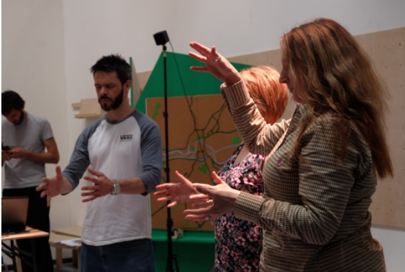
Figure 7: Sensory stage S6 of the workshop, where users (again shown with their eyes closed) were instructed to re-imagine ball-shaped dynamical structures.