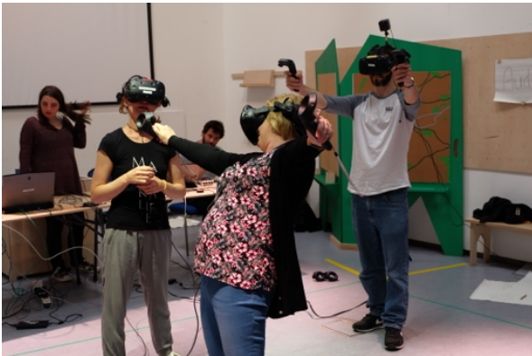
Figure 6: Sensory stages S4 and S5 of the workshop, where users were led into the VR system (shown in Fig 1) and instructed to interact with the real-time C_{60} dynamics simulation, using different combinations of audio and visual feedback described in the text.