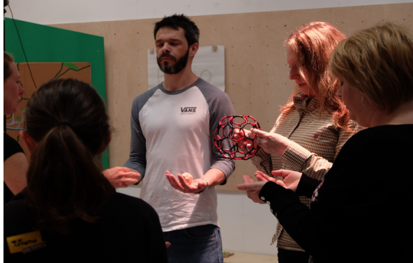
Figure 3: Sensory stage S1 of the workshop, where users (here shown with their eyes closed) were given tangible physical structures.