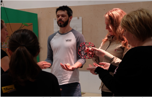
Participants with their eyes closed try and understand abstract structures using only somatosensory mechanisms, without recourse to vision

used to design VR experiences which enable (i) a tactile quality or felt sense of phenomena in the virtual environment (VE), (ii) lingering impacts on participant imagination even after the VR headset is taken off, and (iii) an expansion of imaginative potential.