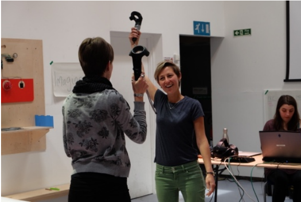
Figure 5: Sensory stage S3 of the workshop, where users (here shown with their eyes open) were instructed to interact with the real-time C_{60} dynamics simulation shown in Fig 1, but using only audio feedback.