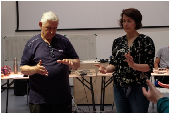
Figure 4: Sensory stage S2 of the workshop, where users (again shown with their eyes closed) were instructed to imagine ball-shaped dynamical structures.

'stages' together. In designing these workshops, we use the unique capacity of our VR framework to enable (i) interaction and manipulation of 3D virtual, dynamic forms, which have little analogue to anything which a participant would experience in the 'actual' world; and (ii) shared VR experiences, in which participants are virtually and physically co-present together.