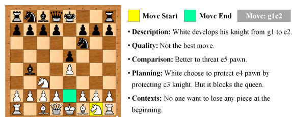
Figure 1: Chess Commentary Examples.

Automatically generating chess comments draws attention from researchers for a long time. Traditional template-based methods (Sadikov et al., 2007) are precise but limited in template variety. With the development of deep learning, data-driven methods using neural networks are proposed to produce comments with high quality and flexibility. However, generating insightful comments (e.g., to explain why a move is better than the others) is still very challenging. Current neural approaches (Kameko et al., 2015; Jhamtani et al., 2018) get semantic representations from raw boards, moves, and evaluation information (threats and scores) from external chess engines. Such methods can easily ground comments to current boards and moves. But they cannot provide sufficient analysis on what will happen next in the game. Although external features are provided by powerful chess engines, the features are not in a continuous space, which may be not very suitable for context modeling and commentary generation.