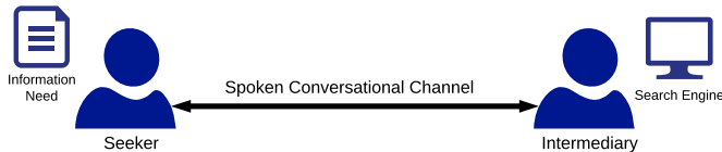
Figure 1: Experimental setup.

Our observational study consisted of a number of sessions with two participants, where one participant acted as the Seeker and the other participant as the Intermediary as illustrated in Figure 1.