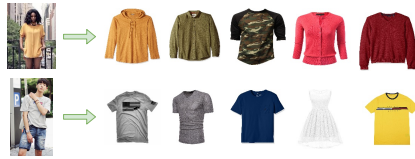
Fig. 6: Failure cases for the proposed system.

clutter, and illumination variance. Moreover, the matching system can match the clothes on multiple attributes simultaneously. It can capture the type of garment as well as other attributes like color and sleeve length. Even the precision values indicate an excellent performance of the matching system, which is visible in Fig. 5.