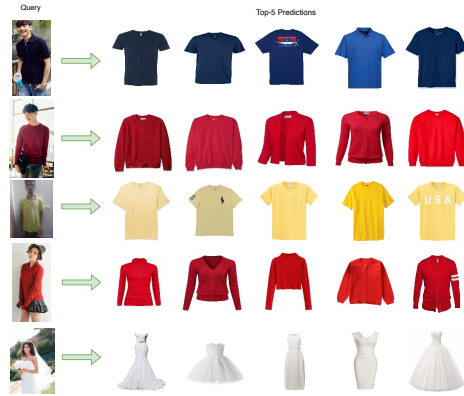
Fig. 5: Top 5 predictions of the framework from 5 sample query images.

clutter, and illumination variance. Moreover, the matching system can match the clothes on multiple attributes simultaneously. It can capture the type of garment as well as other attributes like color and sleeve length. Even the precision values indicate an excellent performance of the matching system, which is visible in Fig. 5.