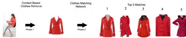
Fig. 1: An example showing the end-to-end working of the street-to-shop problem.

Motivation: More often than not, we tend to search for clothes that we see others wearing, and we find it challenging to frame that dress in terms of the available keywords. It is difficult to describe multi-colored apparel, and with so many new fashion designs hitting the market, it is sometimes confusing to pinpoint the dress type worn. These issues result in users not being able to search for the desired dress in the shopping sites and often getting unwanted results. This is the major drawback of any keyword based matching algorithms and can be solved if the products can be described using visual clues. We base our search model not on keywords but directly on the image content. We take a picture of the dress the user wants to find matches for and run a matching process to determine the closest matches to the dress from the shopping portal, reducing the dependence on being able to search and shop with exact keywords and textual descriptions.