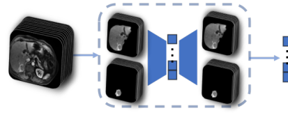
Figure 2: Generating node feature vectors from 3D volumes using autoencoder.

has shown the power of handling heterogeneous inputs. In medical imaging, it has been widely used for brain data analysis, e.g., to handle imaging and non-imaging data [11] and to identify biomarkers from complicated relationships [12].