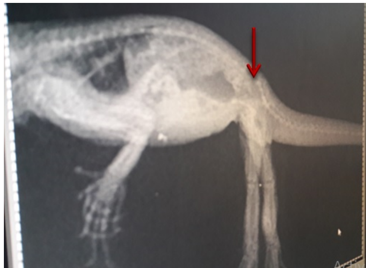
Fig. 3 Sacro-coccygeal compression of vertebral bone (arrow) in the pelvic area (lateral View).

When the distended abdomen was massaged, the iguana passed faeces. In order to alleviate pain Tab. Meloxicam was given orally @0.1 mg/kg b.wt., ( James Carpenter, 2013 ). Multivitamin syrup and calcium syrup was prescribed for a month, orally. It was subjected to infrared therapy of 3minutes for a period of a week (Fig.4). Proper nutrition, feeding, housing and management advice was given ( Divers & Mader, 2005 ). There were no complications during the follow up period of 8 months and the iguana was healthy