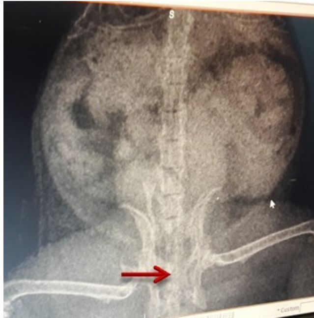
Fig. 2: Sacro-coccygeal compression of vertebral bone (arrow) in the pelvic area (Ventral View).