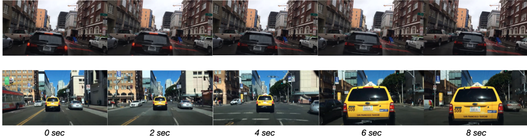
Figure 1: Frame sequences for videos with the highest and lowest standard deviation on the necessity for explanation. The first row corresponds to the video with the highest std, 3.41, and the second row corresponds to the one with the lowest std, 2.11. The average standard deviation for the 38 video clips is 2.97. We noticed that people are easier to reach an agreement on the explanation necessity for the near-crash/emergent driving situations. For example, participants gave similar explanation necessity for the second row, which describes a sudden brake between 4 seconds and 6 seconds. However, for those ordinary or not emergent driving situations, people’s opinions for explanations vary a lot. For instance, participants have different views on the frame sequence in the first row, which is about a car gradually speeding up.

speed, and GPS metadata per frame. Even though the dataset size of the BDD-X dataset is six times greater than the BDD-A dataset, through our empirical analysis, we find a large portion of the videos are ordinary driving scenes (e.g., driving on the highway), which do not contain moments worth explaining explicitly. And the average video duration of the BDD-X is around 30 to 60 seconds, which is much longer for the BDD-A dataset, whose video usually lasts approximately 10 seconds.