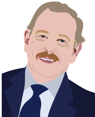
FIG. 5: Reinhard Genzel