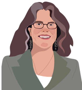
FIG. 4: Andrea Ghez