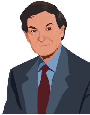
FIG. 3: Roger Penrose