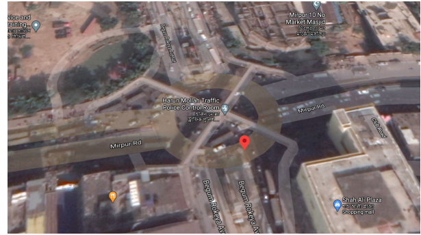
Fig. 1. Satellite view of an intersection merging four roads [3]

We propose a model based on MiniZinc that takes two factors into account to control the traffic flow: vehicle priority and vehicle waiting time. Our intuition is, traffic management can be dealt as an optimization problem where the goal would