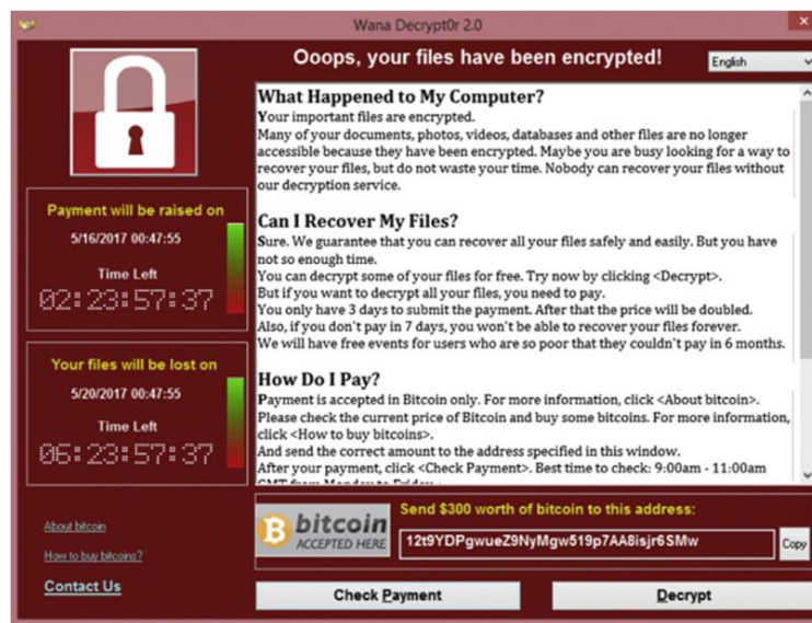
Fig. 1. Screenshot of WannaCry Ransomware [6]

There has been several incidents and news regarding hacking, especially the recent WannaCry ransomware (Fig. 1) which happened across the world, especially the hospital in the UK [6], in which their information was encrypted and unrecovered. The culprit is due to Windows ability to update and the hospital was running on an old firmware and current running on outdated software. The figure below was a screenshot of a ransomware pop up indicating that the ransomware software is running the background.