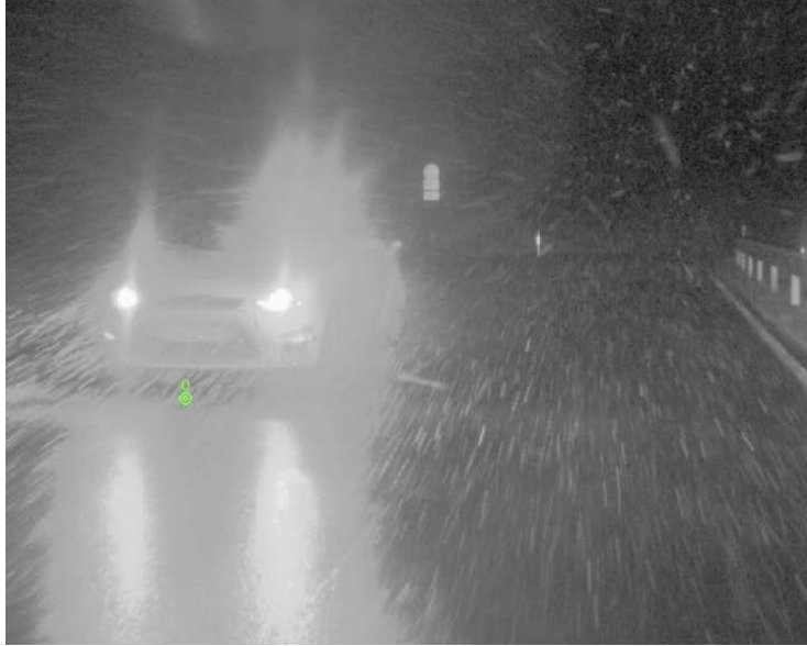
(a) Direct vehicle position