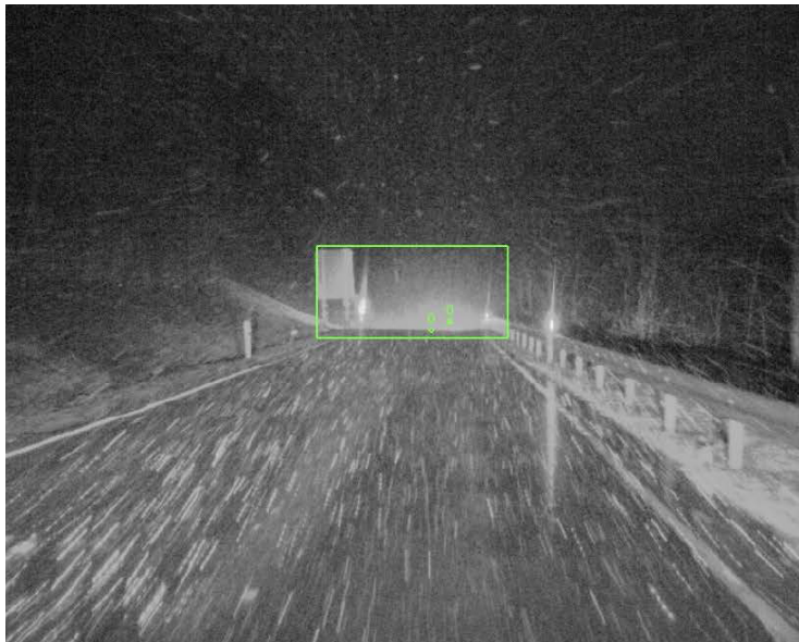
(b) Indirect annotations