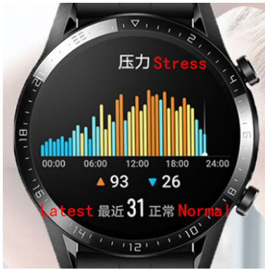
Figure 1: The stress interface on Watch GT