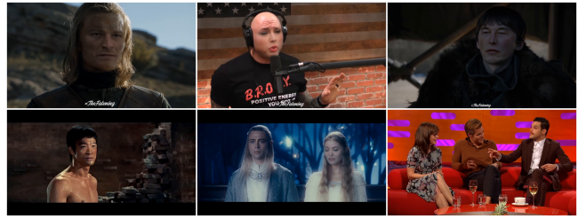
Figure 1: Frame samples of deepfake videos in the wild (YouTube).

Deepfakes were first seen online in 2017, created by a Reddit.com user with the self-appointed name /u/DeepFakes [2]. This user created deepfake videos of celebrities face-swapped into illicit videos,