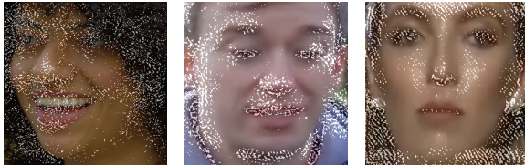
Figure 4: Visualization of salient regions (white dots) as determined by CapsuleForensics, and highlighted using Int-Grad [56]. The first image is a fake face correctly classified as fake, and shows no-discernible-features. The second image is a real face correctly classified as real, and shows face boundary features. The third image is a fake face classified as real, and shows salient background features. Note that these are significant features, and do not preclude insignificant features such as those around the eyes and nose.

DA retraining, we assume access to a small set of videos from DF-W for transfer learning, thus building the potential capability to adapt to the new domain of in-the-wild deepfake videos [36]. We only assume access to a limited number of deepfake videos (around 50), because in practice, it will be hard to obtain access to a large number of deepfake videos created for misuse. In SA retraining, we include new videos from multiple academic deepfake datasets to expand the training data distribution. Overall, our goal is to increase the generalizability of the detection model by learning a new or a boarder data distribution provided by the retraining dataset.