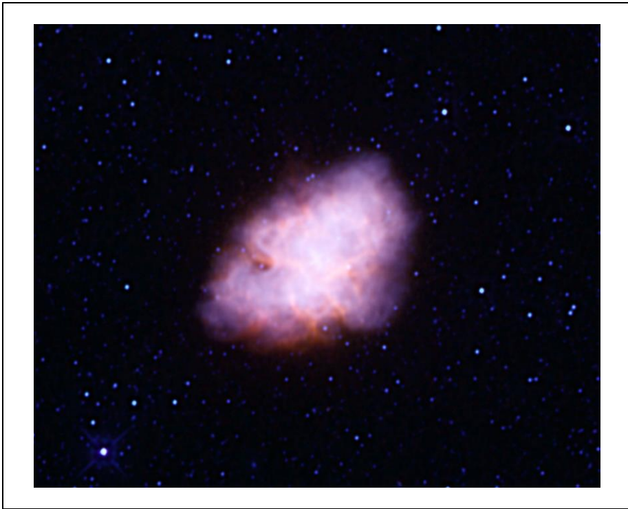
Figure 1. Wide-field Infrared Survey Explorer (WISE) image of the SN 1054 (a.k.a. Messier 1 (M1), NGC 1952, Sharpless 244 and the Crab Nebula), revealing the remnant of a great stellar explosion over 967 years ago.

understood in the so-called “high middle ages period” [1, 2]. During this period, Constantine IX Monomachos ‘The Lone Fighter’ from the Macedonian dynasty was the Emperor of East Roman Empire, and he ruled from 11 June 1042 until 11 January 1055 (all dates in this paper refer to the Julian Calendar). In 1046-1047, he re-established what is arguably the oldest ‘modern’ university, the University of Constantinople - Pandidakterion, which was originally founded in 425 by Theodossius II [3, 4]. This was the most prestigious and advanced European scholarly centre at the time, with its two main schools: Philosophy and Law [5].