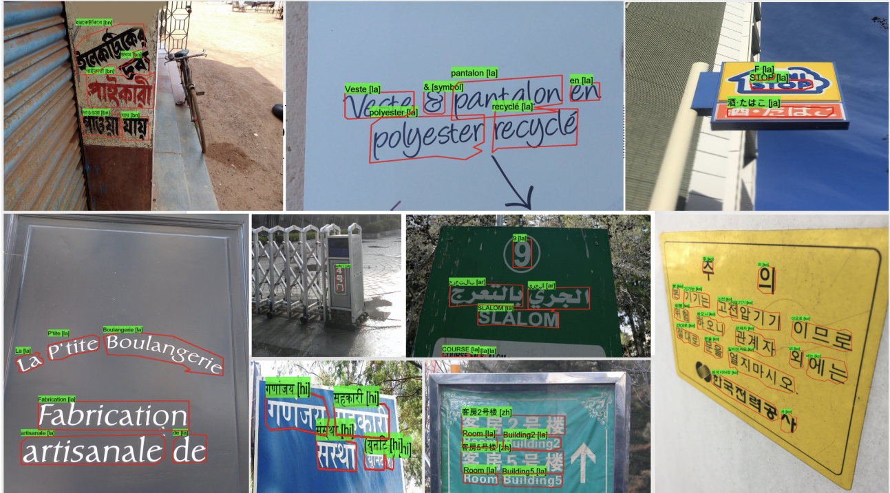
Figure 3. Qualitative results on MLT19. The polygon masks predicted by our model are shown over the detected words. The transcriptions from the selected recognition head and the predicted languages are also rendered in the same color as the mask. The language code mappings are: ar - Arabic, bn - Bengali, hi - Hindi, ja - Japanese, ko - Korean, la - Latin, zh - Chinese, symbol - Symbol.