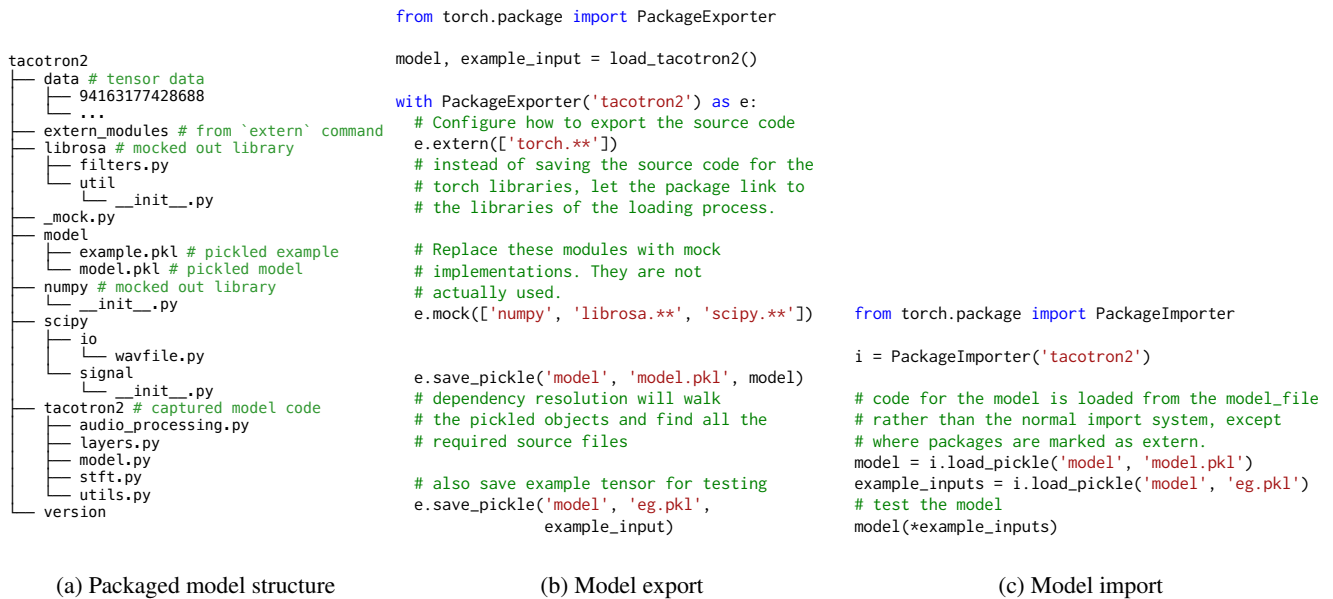
Figure 3. An example of the structure of our model packaging format and the code used to export it and import it.

ferences inside the pickled files are resolved using the source in the archive.