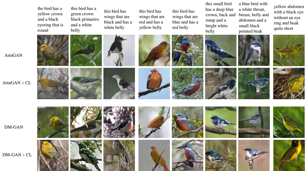
Figure 3. Comparison of example images between our approach and baselines on the CUB dataset.