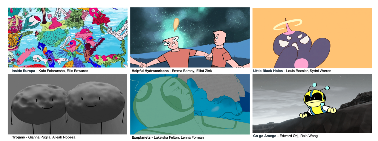
Fig. 1. Examples of the animation styles produced by the students. (compilation © MICA Animation dept.)

and have been broadly used. For further details see [8,9]. The animations have to be accurate to the science but can be whimsical, abstract, poetic, and inspirational rather than directly explanatory (Fig. 1).