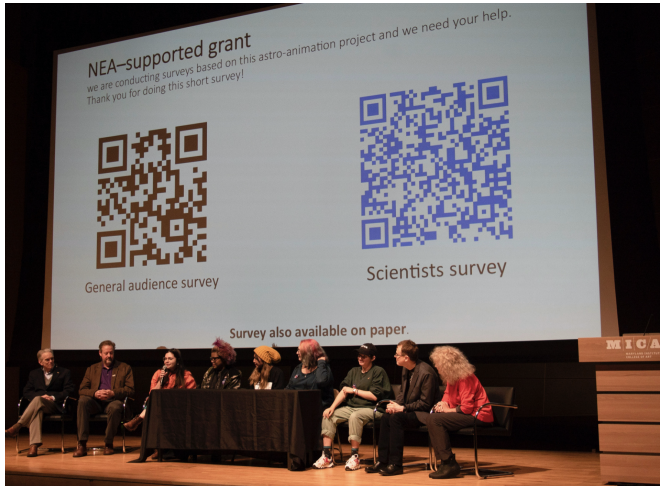
Fig. 3. Surveys at a public scientific outreach event at MICA.