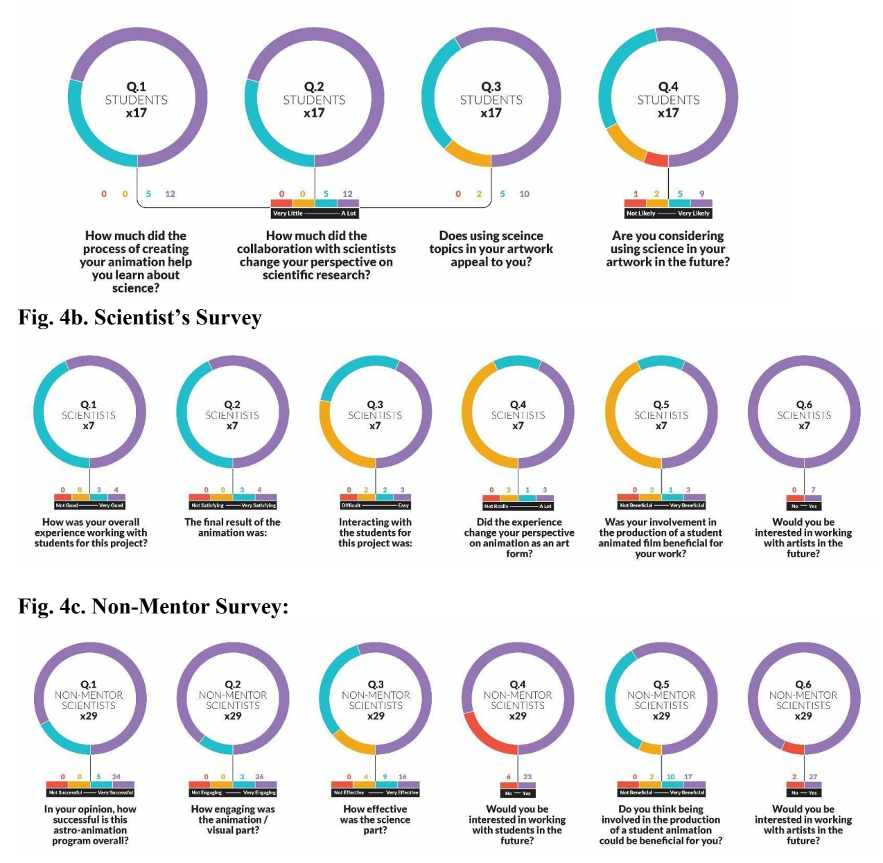
Fig. 4. Survey results and demographic information from surveys of scientists and students.