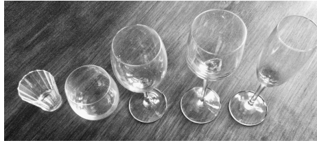
Fig. 2. Search for the separation point in this sorted row! You will see, that almost “naturally” your brain tries to identify different binary characteristics (which define the shape of the glasses) when searching for delimitation.

Sorting objects is a complexity reduction. Given a set of m objects, i_1, \dots, i_m , the overall task is to find relevant characteristics. In this section, characteristics are assumed to be unavailable at the beginning of our analysis. The given task is then related to the task of grouping the objects into meaningful clusters. Once the clustering of objects is given, one can start to extract the differences and commonalities which are “behind” this clustering. Let us assume that we aim at a clustering into two groups, then we can find 2^{m-1} different possible clusterings. This number can be reduced: Suppose the objects are arranged in a sorted row, as is the case in Fig. 2. Then clustering of the objects by finding a separation point in this sorted row reduces the clustering problem to only m possible solutions.