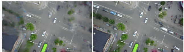
Fig. 3. Visual comparison of RIFE (left) and HSTR-Net (right) on Visdrone images.

Tables 1 and 2 also provide HSTR-Net results with and without deformable convolution. The use of trainable offset estimator and deformable convolution in exchange for fixed warping module improves PSNR/SSIM results in both Vimeo90K and Visdrone datasets. However the inference time of the model is also significantly increased with the use of deformable convolution. Drones require low memory, fast and less computationally demanding networks for real-time processing due to limitations of computational power of embedded GPUs. HSTR-Net based on warping instead of deformable convolution provides a light-weight alternative for embedded real-time processing and achieves competitive results on reconstructed image quality.