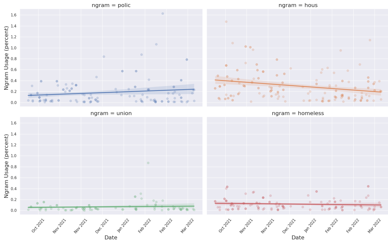
Figure 3. N-gram usage over time for the entire Councils in Action dataset (Seattle City Council, King County Council, and Portland City Council) from October 1, 2021 to April 1, 2022.

We can further use this same n-gram viewing function to compare across all councils in the Councils in Action dataset to understand if the trends in Seattle hold across the entire dataset. Using the six months of data available for all municipal councils (October 1, 2021 to April 1, 2022), we can investigate if there are any collective trends in n-gram usage. Figure 3 shows the usage of n-grams stemming from “police”, “housing”, “union”, and “homelessness” from October 1, 2021 to April 1, 2022 during meetings of the Seattle City Council, King County Council, and Portland City Council.