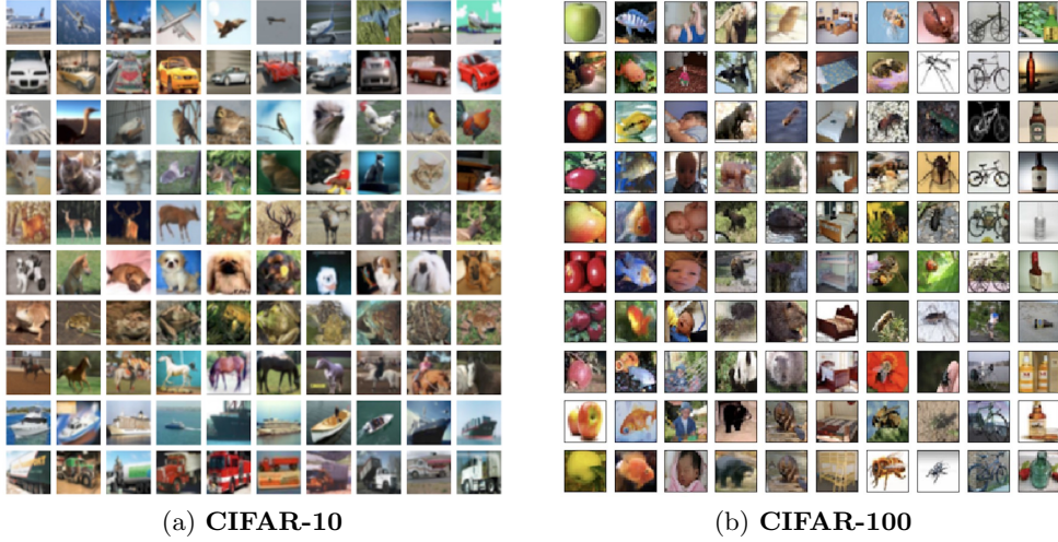
Figure 1: Sampled images from CIFAR-10 and CIFAR-100 training datasets.

with i being the i -th layer of DNN and n being the number of neurons at i -th layer. The magnitude s_i in (22) has been calculated precisely by (Rastegari et al., 2016). To keep the paper self-contained, here we recall the calculation details of s_i .