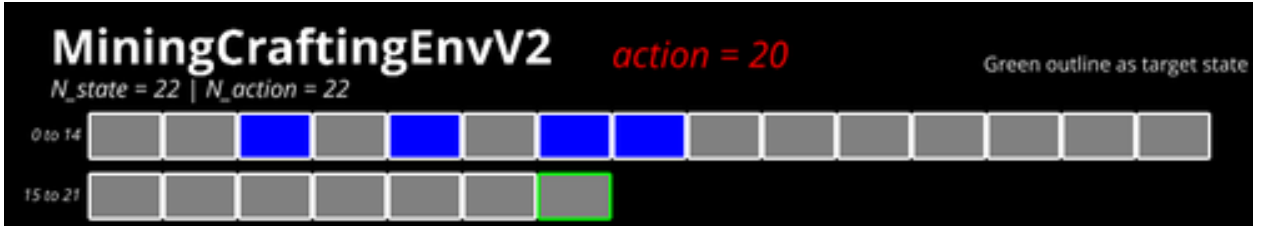
Figure 2: Illustration of planning in the MiningV2 environment. Grey and blue represent the dimensional state value being zero and one, respectively. Each planner must execute actions to turn the target dimensional state value (outlined in green) from zero to one under noisy transitions.