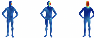
Figure 2: Wavelets on the FAUST dataset with g(\lambda) = e^{-0.0005\lambda} , j = 1, 3, 5 from left to right. Positive values are red, while negative values are blue.

We first study the MNIST dataset projected onto the sphere as visualized in Figure 1. We uniformly sampled N points from the unit two-dimensional sphere, and then applied random rotations to the MNIST dataset and projected each digit onto the spherical point cloud to generate a collection of signals \{f_i\} on the sphere. Table 1 shows that for properly chosen \kappa , the mesh-free method can achieve similar performance to the mesh-based method. As noted in Section 6, the implied constants in our theoretical results depend on \kappa . By inspecting the proof of Theorem 5.4 of [14] we see that for larger values of \kappa , more sample points are needed to ensure the convergence of the first \kappa eigenvectors in Theorem 9. Thus, we want \kappa to be large enough to get a good approximation of H^1 , but also not too large.